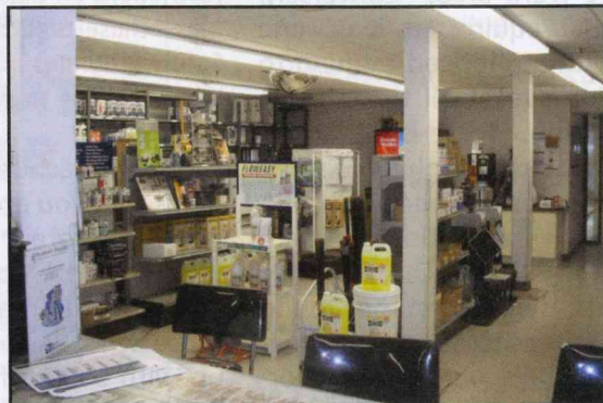
Check full of information in Worcester...