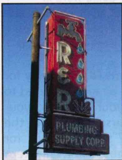
The historic R & R sign in Worcester

You can view all eight location details and get more information at peabodysupply.com or thebathshowcase.com