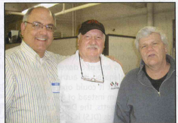
Kohler night in Worcester with some old and new friends!